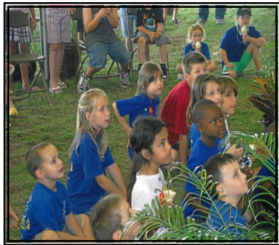
Candlelighters' children enjoyed The Florida Air Show

Candlelighters understands parents of children with cancer are often young, have a limited income and they have other children. This is why we provide all services at no cost to the family.